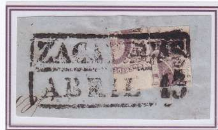
Zacatecas. 2 quadrisections of 8 reales to pay a rate of 4 reales. VERY SCARCE USAGE.