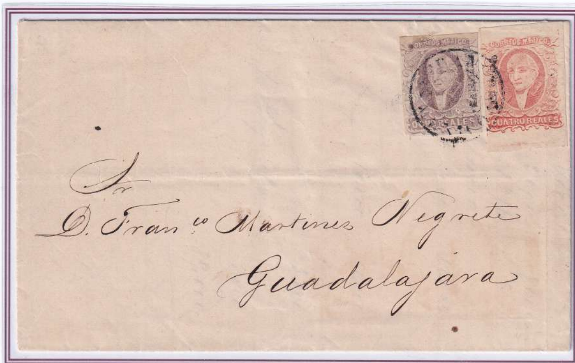
1857, January 5. MEXICO to Guadalajara

12 reales postage for 2 ¾ ounce weight, for distance of more than 17 leagues or 51 miles.