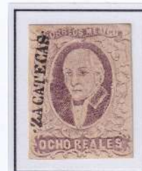
ZACATECAS@ Total sent: 6,600. (10 consignments) Total used: 6,188. Rarity ratio: 3.9