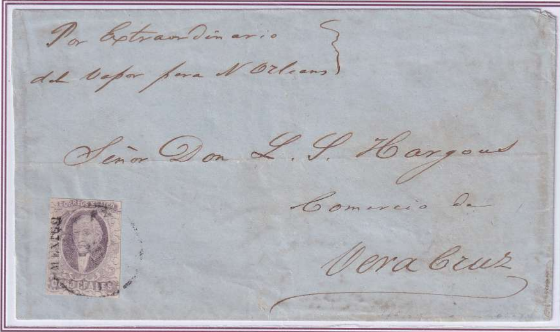
1857, January 5. MEXICO to Veracruz

To guarantee the timely arrival of the correspondence at port or to preserve the contained goods, the couriers employed by the English consulate in Veracruz made the trip between Veracruz City and Mexico City. This form of transport was much safer than the traditional or "ordinary" Diligence. The tariff included the payment of the transit mail in Mexico by Law plus the payment of the carriage fee by the consulate employee. This unique type of mail between the cities of Mexico, Puebla and Veracruz is called POR EXTRAORDINARIO .