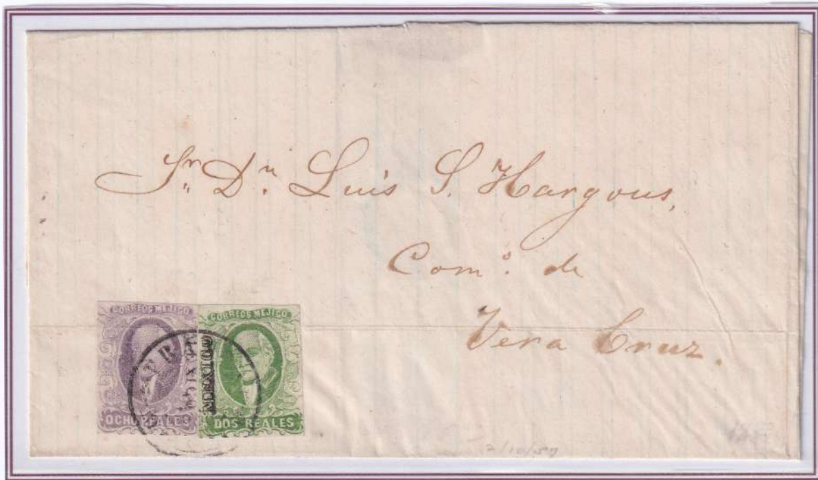
1857, February 18. MEXICO to Veracruz

Total sent: 24,040. (138 consignments) Total used: 23,909. Rarity ratio: 1