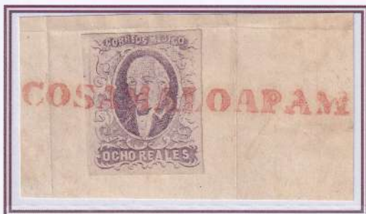
COSCOMATEPEC – VERACRUZ. No district name. For its authentication, the stamp was removed from the piece of paper and reattached with a hinge. Prephilately cancel. YAG-BASH VC 70. ONLY KNOWN