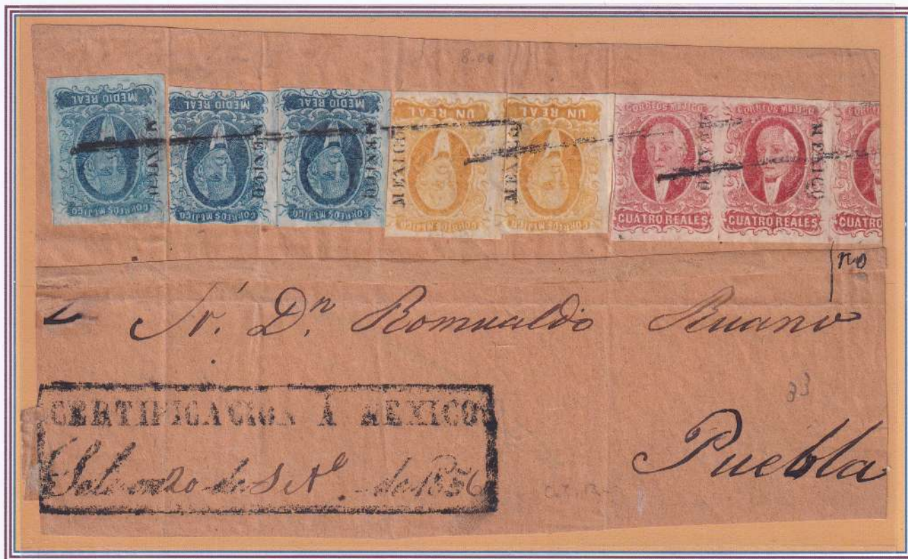
1856, September 20. MEXICO to Puebla @

This rate was approximately half of that charged before the use of the stamps. This was expected to increase the use of the correspondence, which did not occur as the country was plunged in a constant civil war which resulted in a new rate change dated December 15, 1956; effective December 20, 1856.