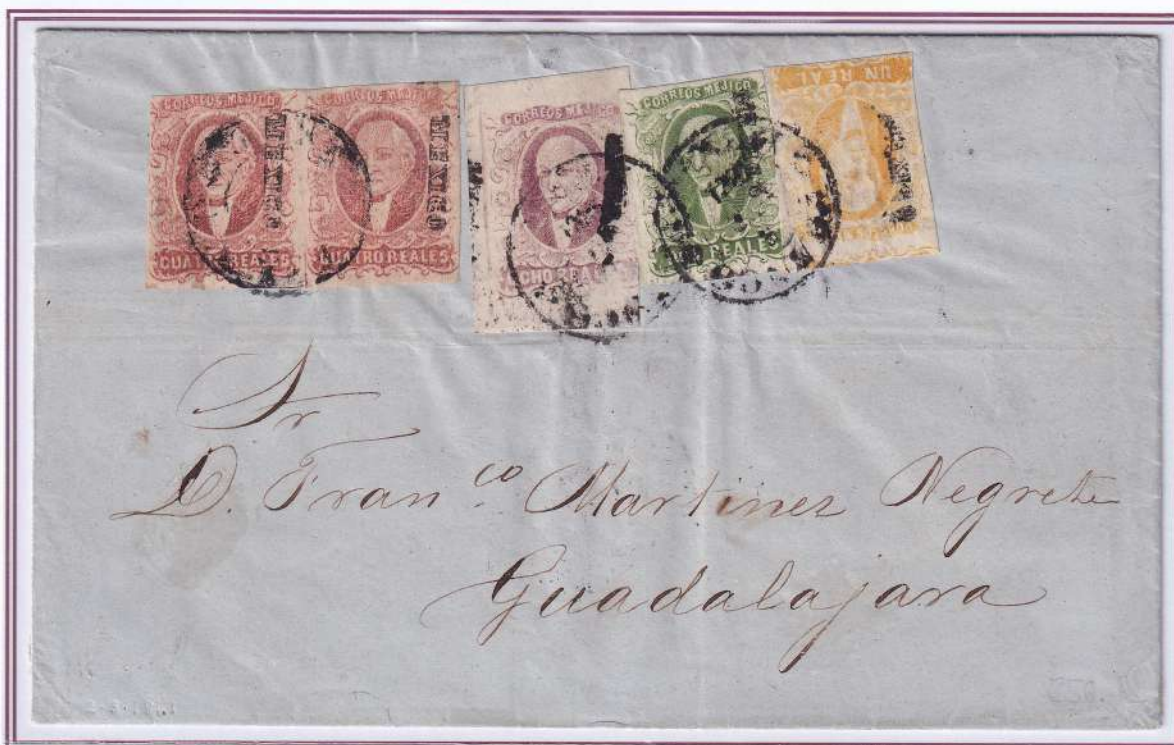
1861, February 3. MEXICO to Guadalajara.@

12 reales postage for 2 ¾ ounce weight, for distance of more than 17 leagues or 51 miles.