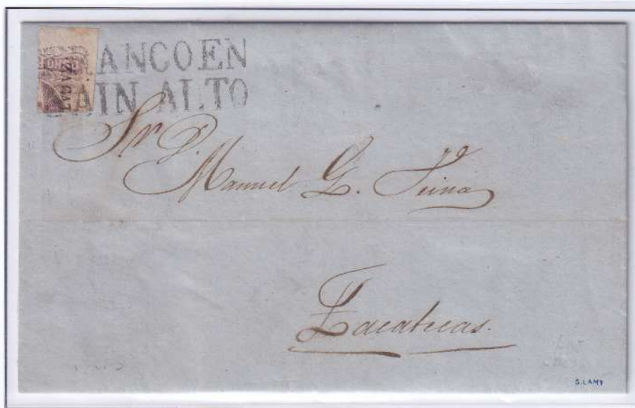
2 reales rate @ Fragment of a 8 real Zacatecas - Mexico. October 4, 1858. Cancellation Franco Sain Alto SZ 1910. Corresponds to a letter weighing ½ ounce and distance greater than 16 leagues.

Zacatecas received in 1858, dated April 22 and November 3, only two shipments of stamps. The post office had for a long time a shortage of 2 reales stamps. Fractions of half and quarter stamps were used until the arrival of the second shipment.