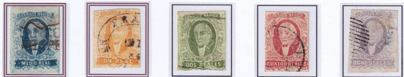
SAN FELIPE (USED 240)

Once the correspond rate was paid, the stamp was cancelled with a postmark or canceler to deface the stamp, demonetize it, and prevent its reuse.