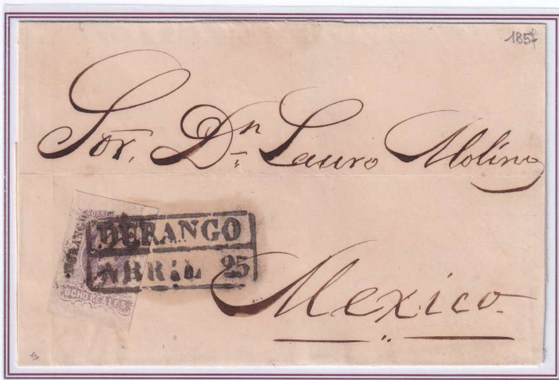
1857, April 25. DURANGO to Mexico @

Chiapas with the exceedingly rare sub-office Pichualco cancel. Chiapas had 8 sub-offices: San Cristobal, Comitán, Chiapa, Pichualco, San Bartolomé, Tapachula, Tonalá and Tuxtla.