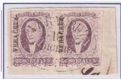
VERACRUZ@. Sent 9,820; (13 c) Used 9,458. RR 2,5