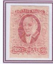
Colour proof in red of the 2R. @ Plate I. Copies Printed 60 No more than 10 copies in existence

From August 1 to August 29 the stamps were only issued to Mexico City. After that date, the stamps were distributed to their places of destination in stagecoaches, and the corresponding endowments were delivered to each post office. By the year 1856 a total of 59 offices were constituted.