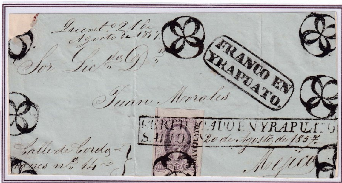
1857, August 20. IRAPUATO to México

Irapuato to Mexico 82 ½ leagues: Irapuato, Buena Vista, Salamanca, El Guaje, Celaya, Apaseo, La Calera, El Rayo, Estancia las Vacas, Querétaro, La Noria, El Colorado, Arroyo Seco, El Sauz, Las Troges, San Juan del Río, Palmillas, San Antonio, Ruano, Encinillas, Arroyo Zarco, Soyaniquilpan, Tepeji del Río, San Miguel, Cuautitlán, La Lechería, Tlalnepantla and Mexico.