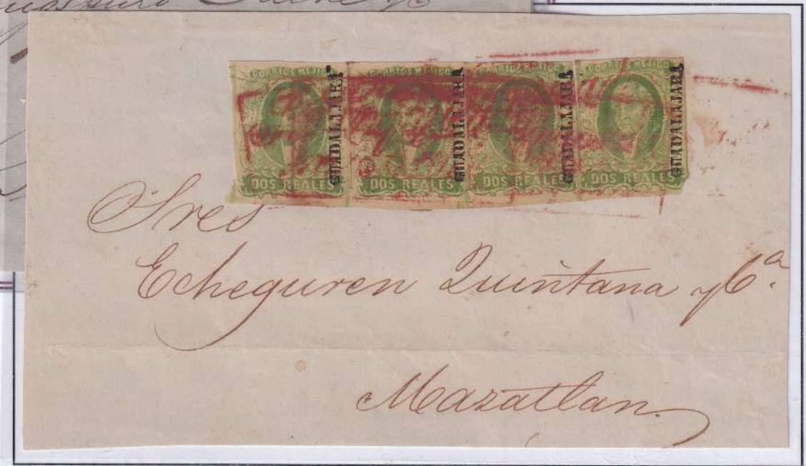
Front with a Strip of four Guadalajara, JALISCO 2 reales, used in Tepic, NAYARIT, to cover the 8 reales rate.

LAGOS received a first consignment of 600 8 reales on February 27, 57. It was on April 28, 58 when received a second one with 300 stamps. By December 57 none 8 reales was in existence being replaced with large strips of 1 and 2 reales