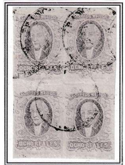
1859 BLOCK OF 4@

All Mexico 8 reales stamps are considered scarce. With 100k delivered to districts and a surviving rate between 2 and 4 percent, indicates, in the best of the scenarios no more than 3,700 examples at our disposal. Many of these stamps were cut into halves, quarters and even eighths. Research has determined that to consider 1000 stamps in existence could be more than optimistic. This collection includes pieces of singular rarity such as the red colour proof of the 2 reales stamp, the block of 40 stamps of 8 reales Victoria district, the letter from Mexico to Guadalajara franked with four different stamps, a letter with an incredible franking of 20 reales paid with 10 stamps of 2 reales, cover of the Lagos district with a franking of 8 reales paid with 8 one-real stamps with the largest known strip of one-real stamps on a letter; last but not least, a letter franked with one strip of 4 cuatro reales stamps (lack of 2 single 8 Reales) as well as other 8 Reales pieces of which only a handful of examples have survived.