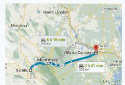
87 leagues of distance, following the route Saltillo - Monterrey to Camargo