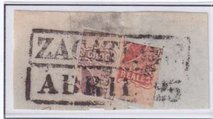
Zacatecas. quadrisection of 4 and 8 R to pay a rate of 3 reales.