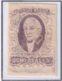
NO MONETARY VALUE

Hard wove paper. One plate of 60 subjects arranged in 6 columns and 10 rows. Frameline present. All stamps were delivered from the same printer on July 30 th and December 30 th , 1856.