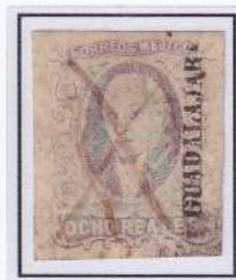
Lilac Oxidized tone