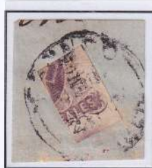
Morelia. 1856. 4 reales carmine colour fractioned to pay a rate of 1 real and stamp of 8 reales fractioned to pay a rate of 2