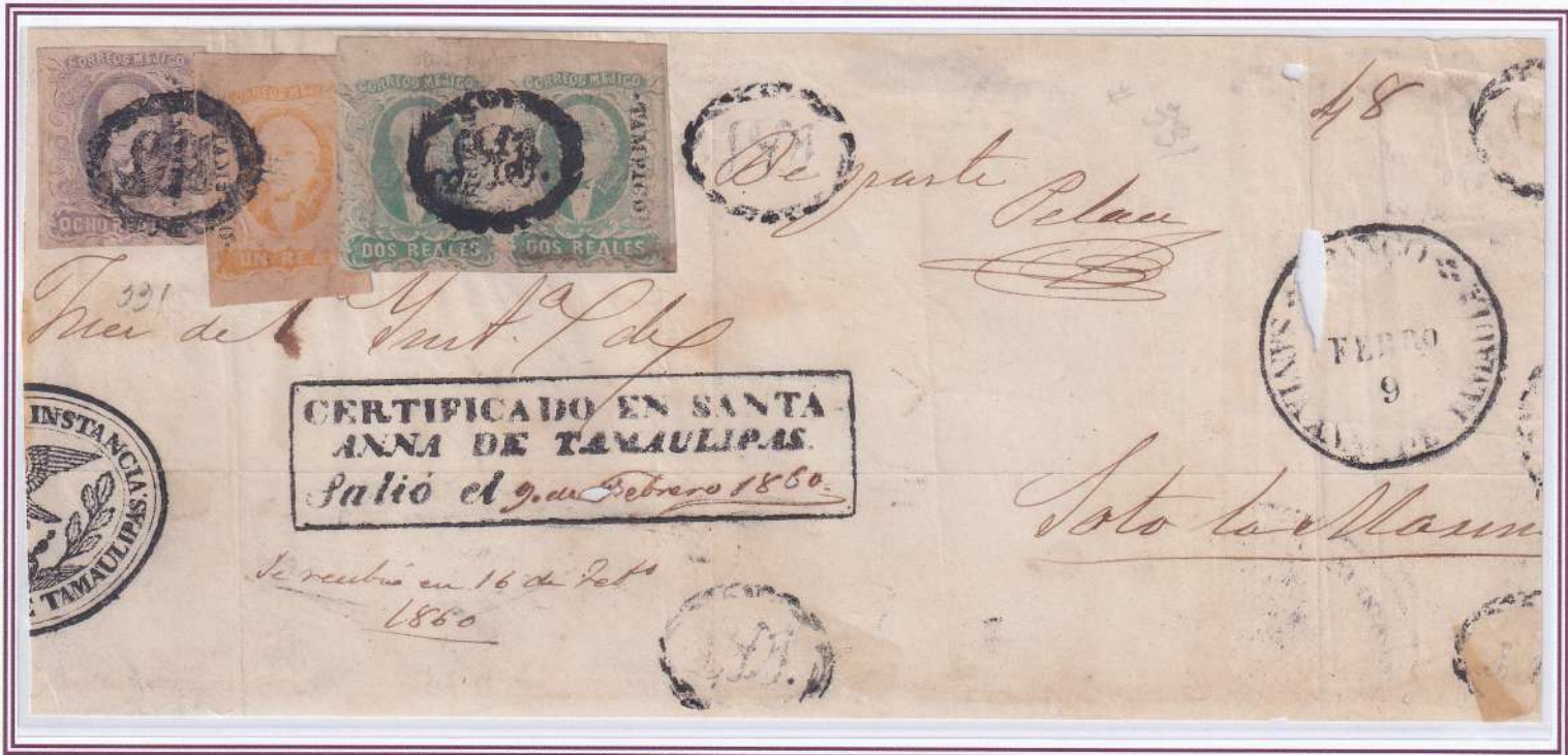
1860, February 9. SANTA ANA DE TAMAULIPAS to Soto de la Marina

The registration fee was 8 reales, it included the postage for a letter up to \frac{1}{2} ounce. The receipt of registered letters had to be acknowledged by signature of the addressee on the reverse of the cover front. The size of the cover had to be demonstrated by