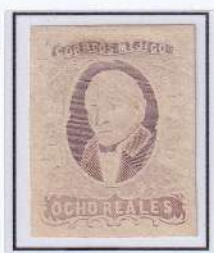
Pale Violet Thin paper