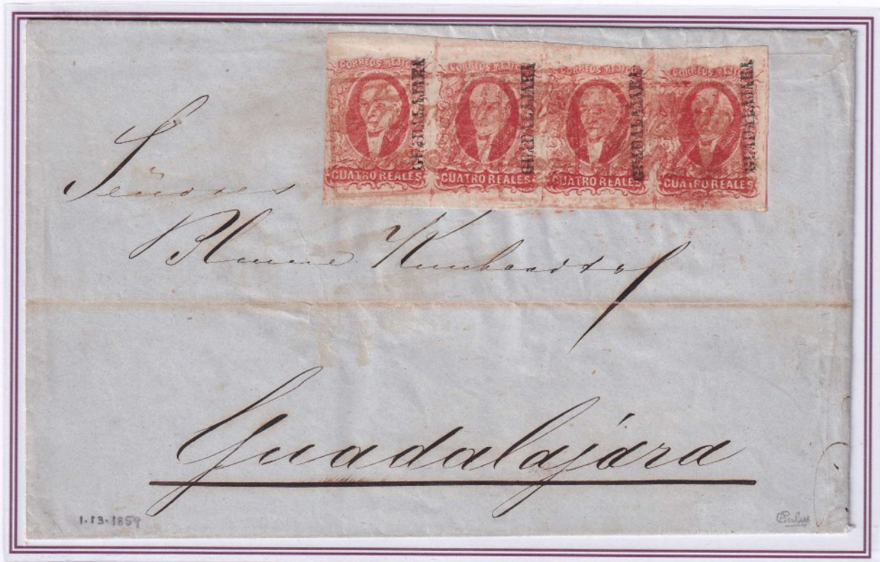
TEPIC to Guadalajara.

Strip of four 4 reales Guadalajara district stamps. 99 ½ leagues is the distance between Guadalajara and Tepic.