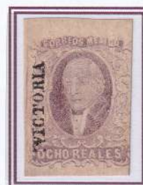
VICTORIA Total sent Aug 30, 56: 780 (1 consignment) Total used: 770. Rarity ratio: 31,1