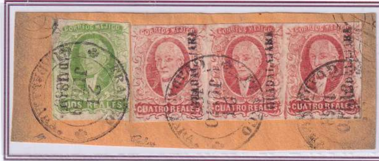
1858. GUADALAJARA. Registered fragment@

8 reales corresponds for payment of registered mail and 6 reales for 1 1/4 ounces and payment on delivery up to 30 leagues.