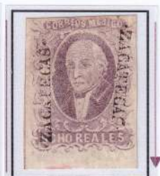
ZACATECAS@ Double Overprint tête bêche