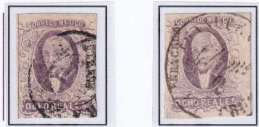
Left FRAMELINES Right