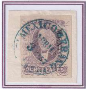
MEXICO@ CLICHE STAMP SZ 824A Cancel in blue not recorded. Illustrated in Schatzkes ONLY KNOWN