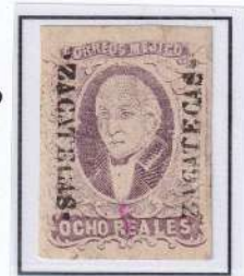
Morelia and Zacatecas. 1856. Stamp of 4 reales and 8 reales with double district overprint printing and prepared to be subdivided in halves or quarters.