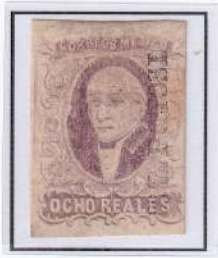
SAN LUIS POTOSÍ

Total sent August 30, 56.: 420. (1 consignment) Total used: 420. Rarity ratio: 56.9