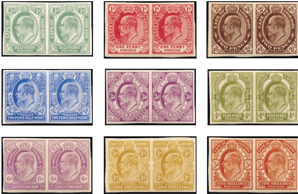
a Imperforate pairs of the Cape of Good Hope postage stamp set. See p. 30.