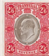
Transvaal Appendix B (folded and reduced) showing the proposed and approved colours for revenue stamps. See p. 236.