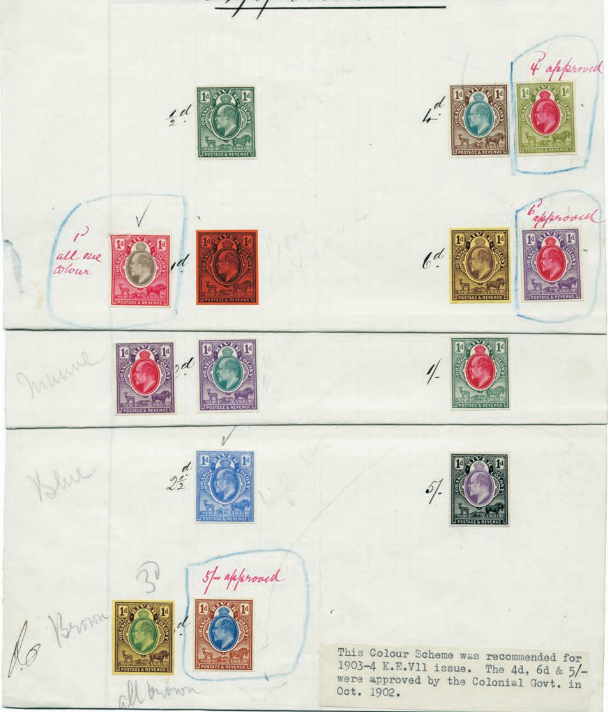
Orange River Colony Appendix A (folded and reduced) showing the colours selected for the postage stamps. See pp. 150, 157.