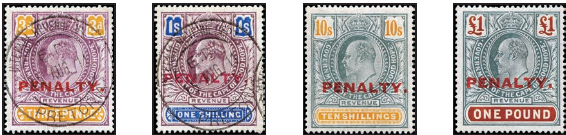
b Cape of Good Hope revenue stamps overprinted PENALTY in 1911 for use across South Africa. See p. 80.