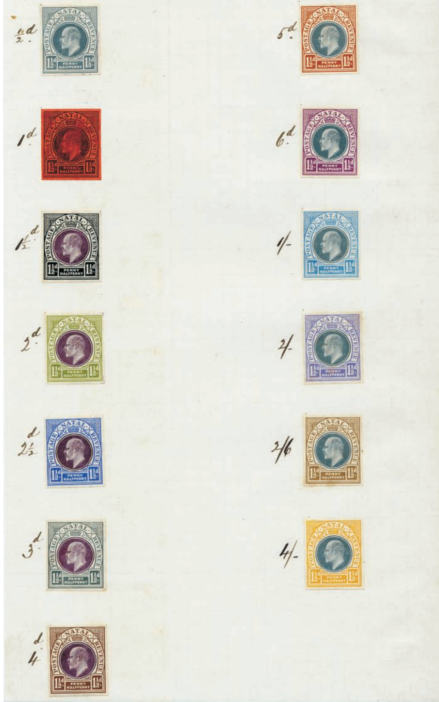
Natal Appendix A (reduced) showing the proposed colours up to the 4s denomination. See p. 94.