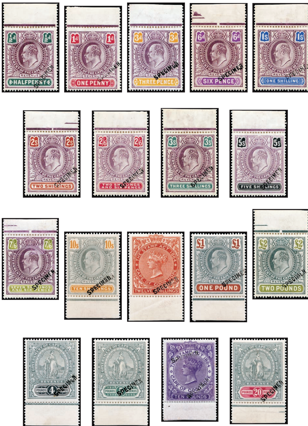
Set of Cape of Good Hope specimen revenue stamps presented to the Royal Empire Society in 1910. See p. 67.