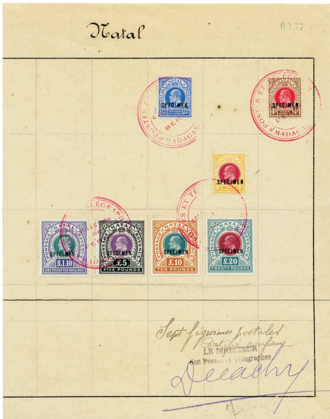
Natal UPU specimens on a Madagascar Post Office ledger page (folded and reduced). See p. 130.