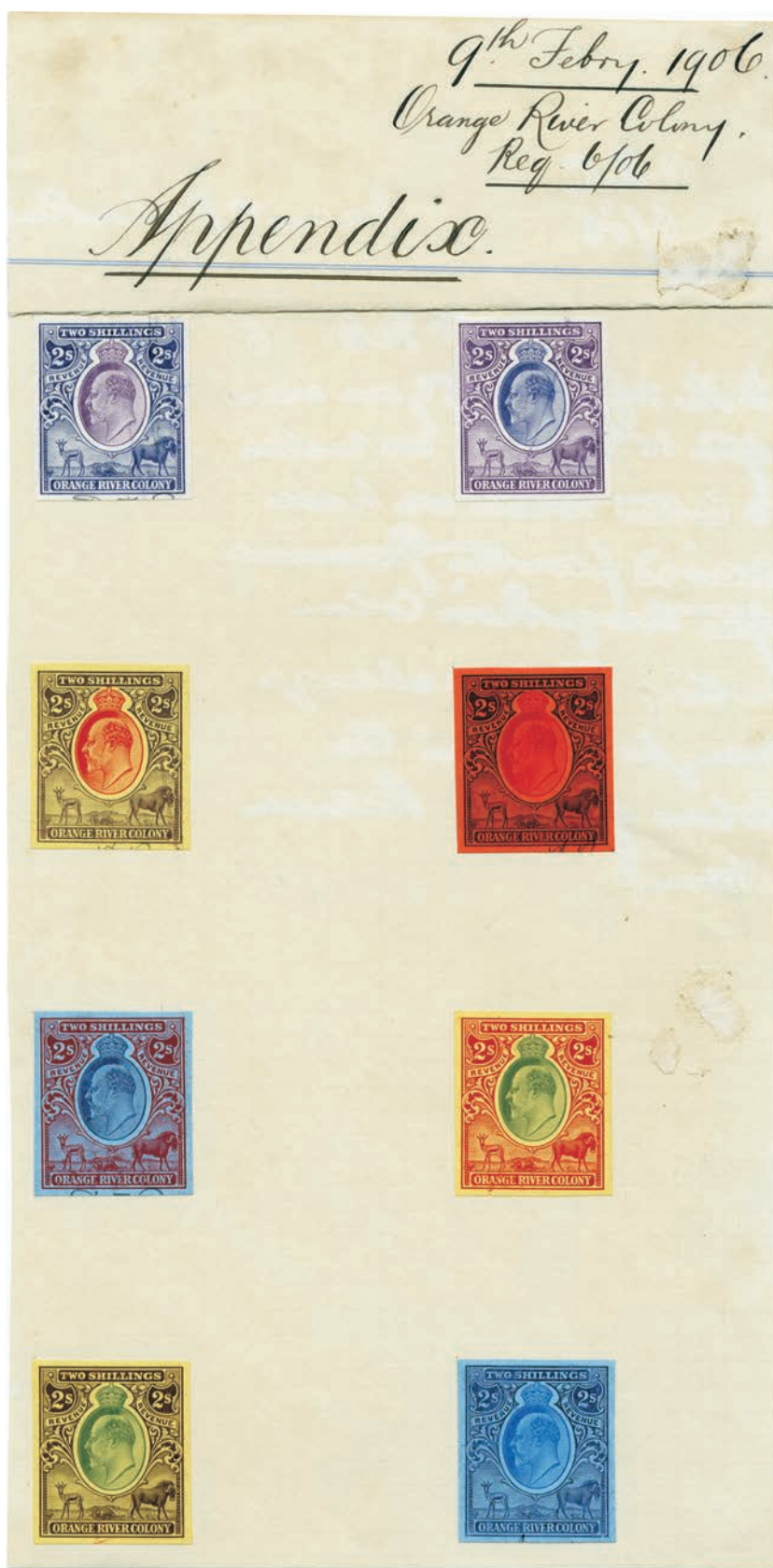
Orange River Colony Appendix for 1906 colour change (folded and reduced) for 2s revenue stamps. See p. 174.