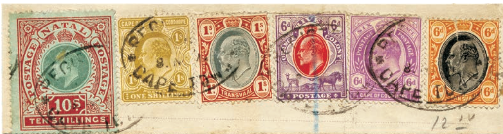
c Interprovincial piece showing the use of stamps of all four colonies. See p. 286.