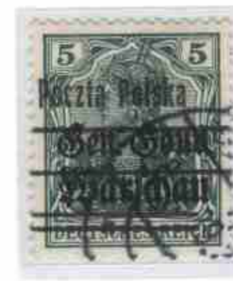
grey-dark green GGW mat