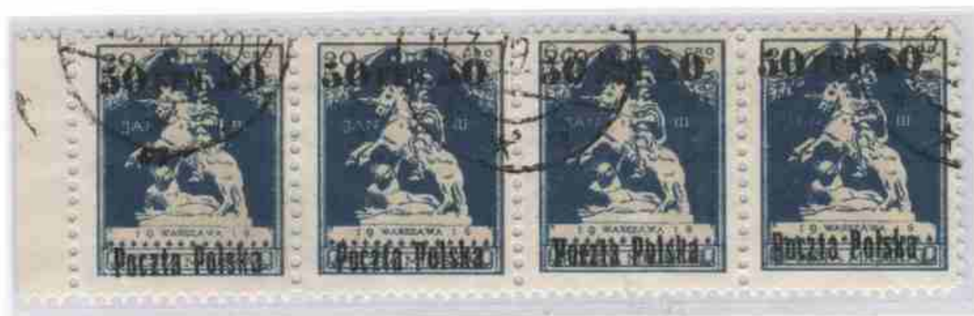
B1 - Poetzta