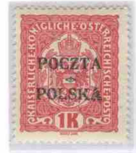
B3 – defects A