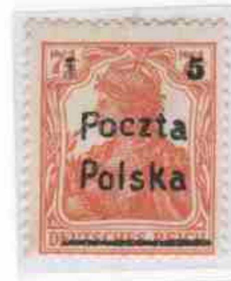
B2 - left damaged 5