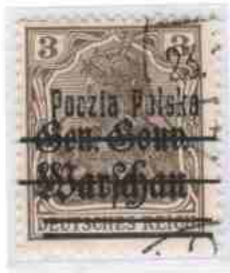
yellow-olive-brown GGW semi-glossy

first row in the sheet - distance of the second to third lines 3.5 mm