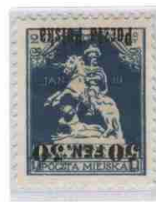
inverted overprint R