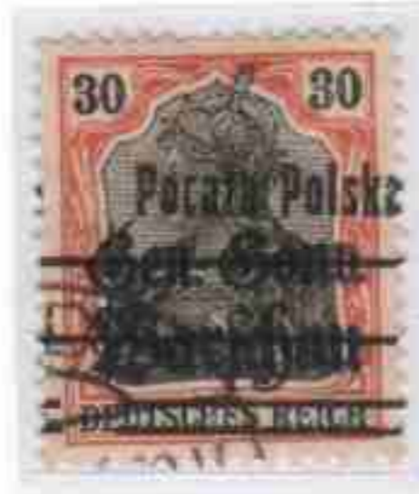
B1 - Pocata