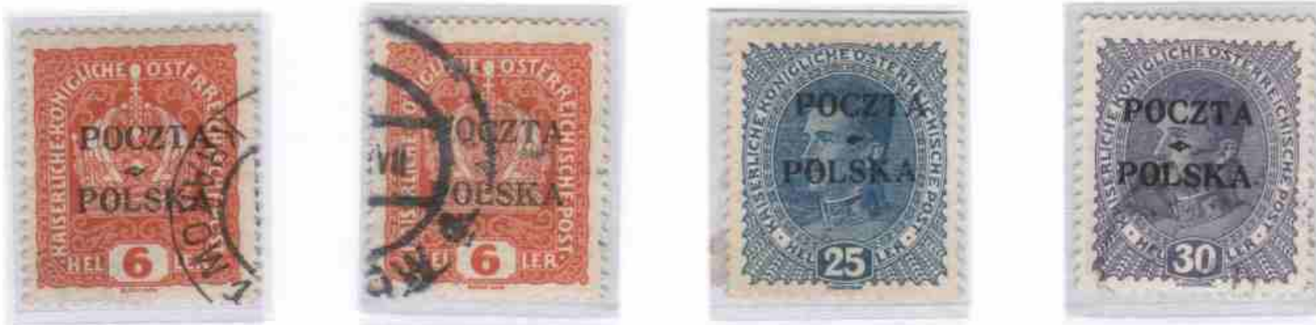
B5 – defects C

comb perforation 12½ - typographic overprints in form II - print defects all have a guarantee of authenticity