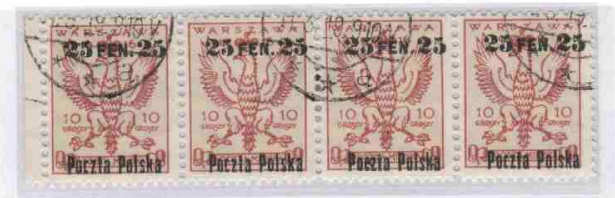
B1 - Poetzta