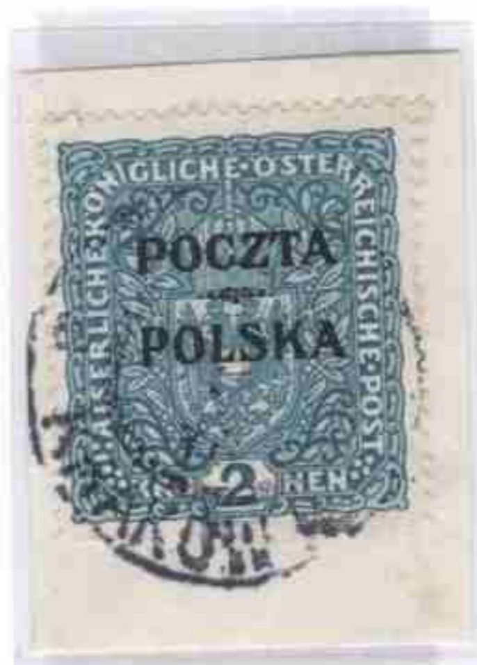
light greyish blue white paper