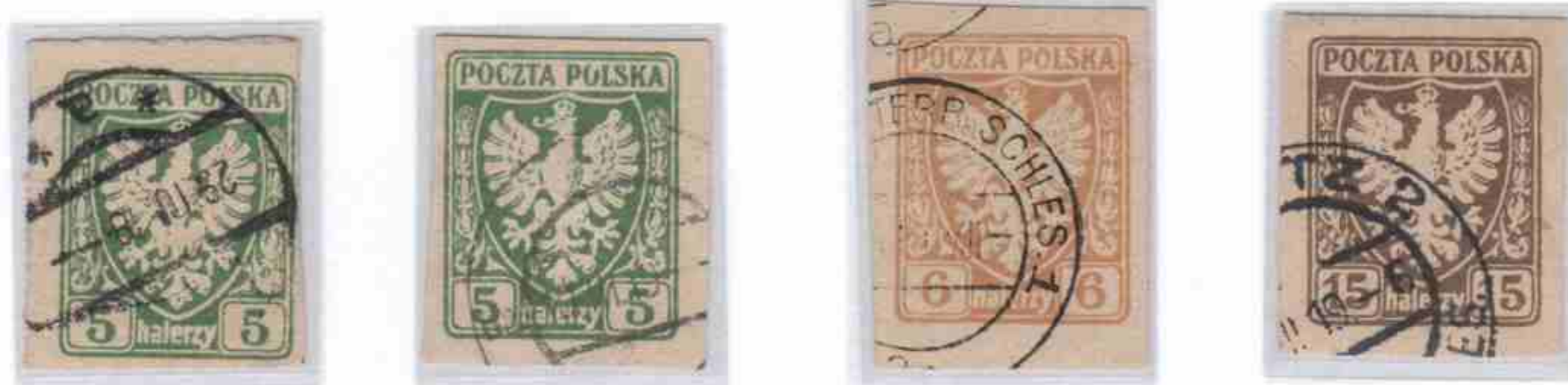
B1 - interrupted O in POLSKA