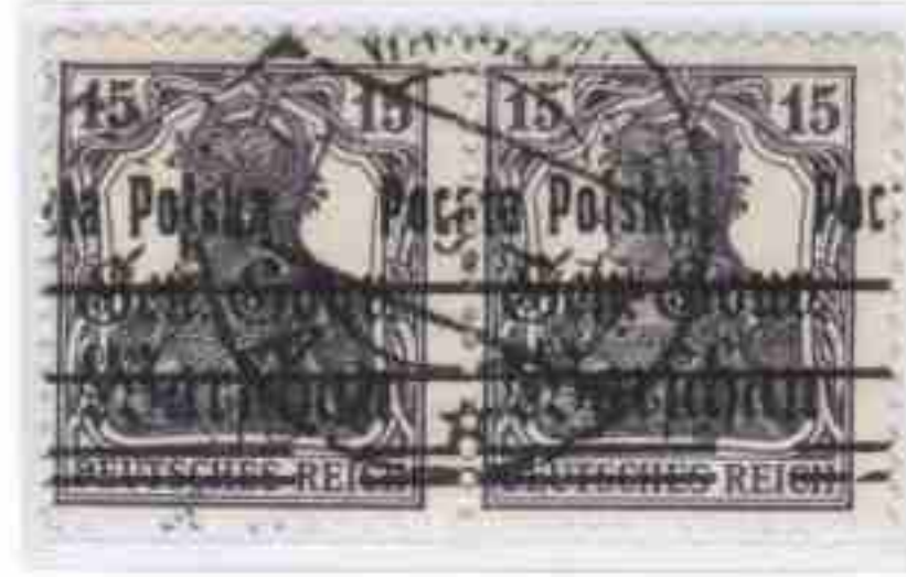
B1 - Pocata