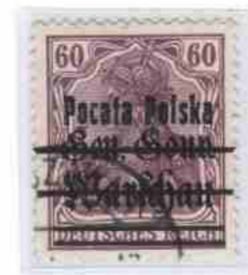
B1 - Pocata