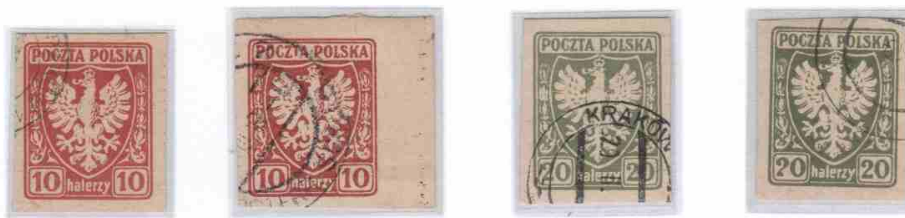
B1 - defects TA