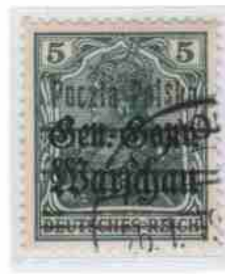
B6 - raised s GGW glossy