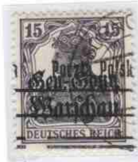
violet GGW semi-glossy