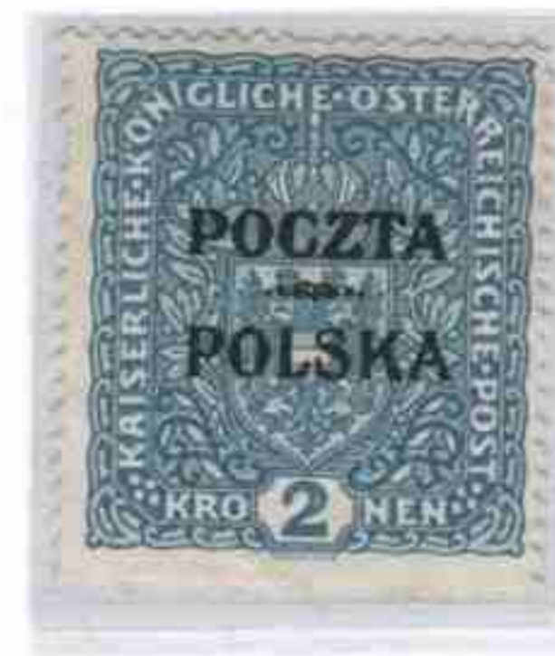
light greyish blue white paper B6 – thin S