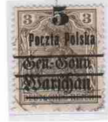
B4 - 3rd line missing