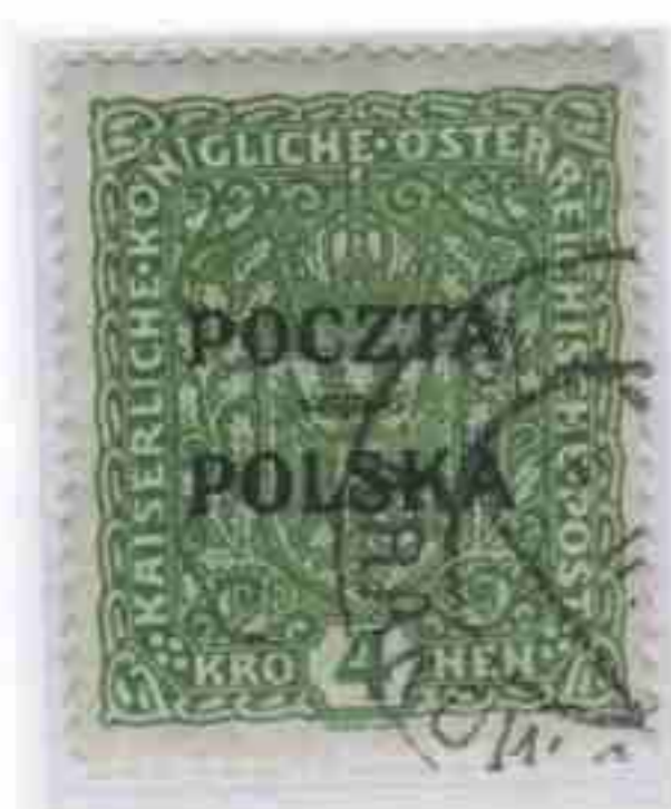
light yellowish green