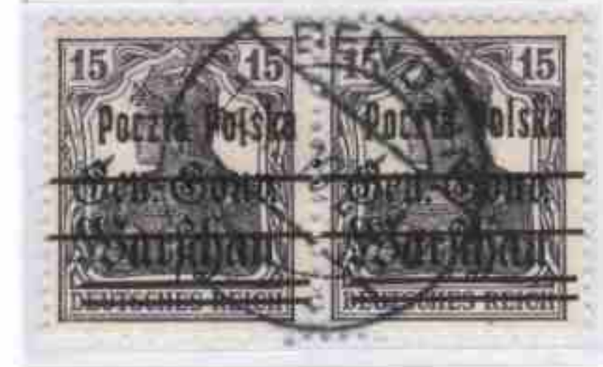
B3 - lowered I