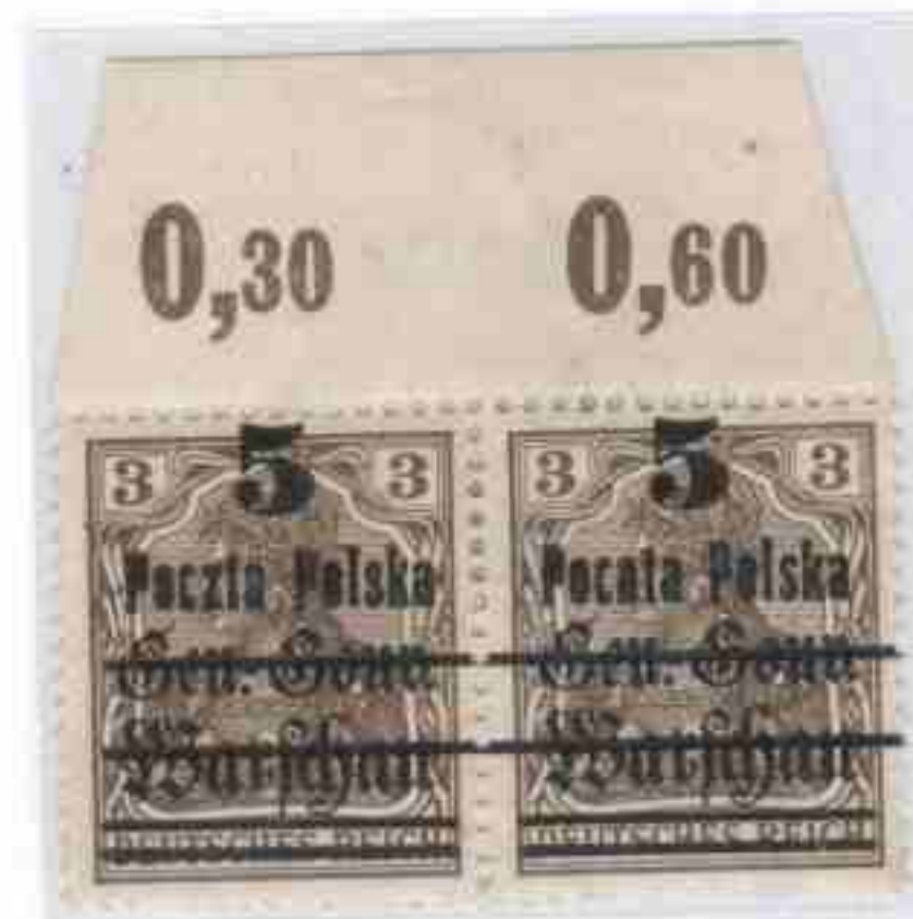
B1 – Pocata