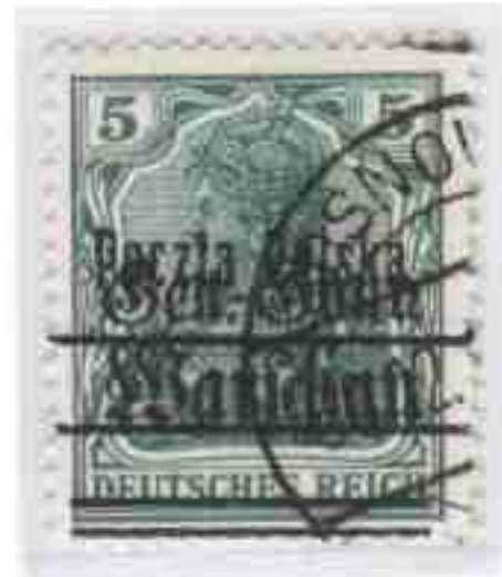
gray dark green GGW mat

1918. December 5. Temporary overprinting of the so-called Warsaw edition 2 on German occupation stamps "Gen.-Gouv. "Warschau" overprint form I - color shades of stamps and printing defects