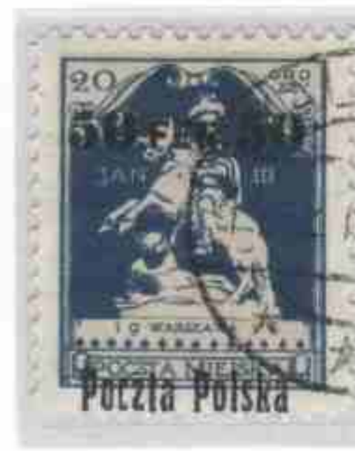
B2 – fault FEN