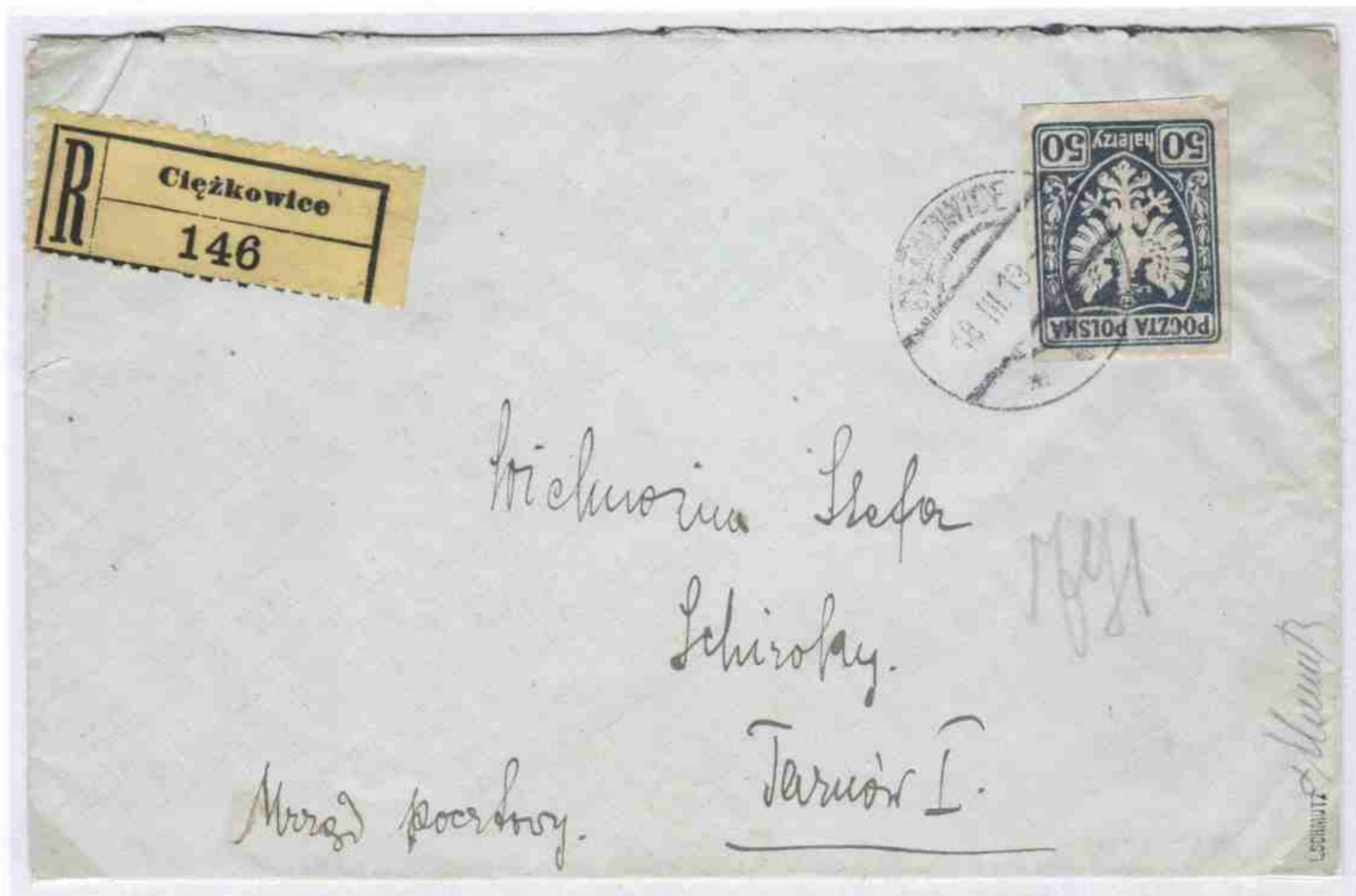
a stamp on the envelope of a registered letter sent on March 18, 1919 from Ciężkowice to Tarnów, fee for a long-distance letter 25 halls. + command 25 halls.