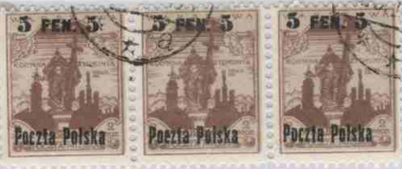
B1 - Poetzta