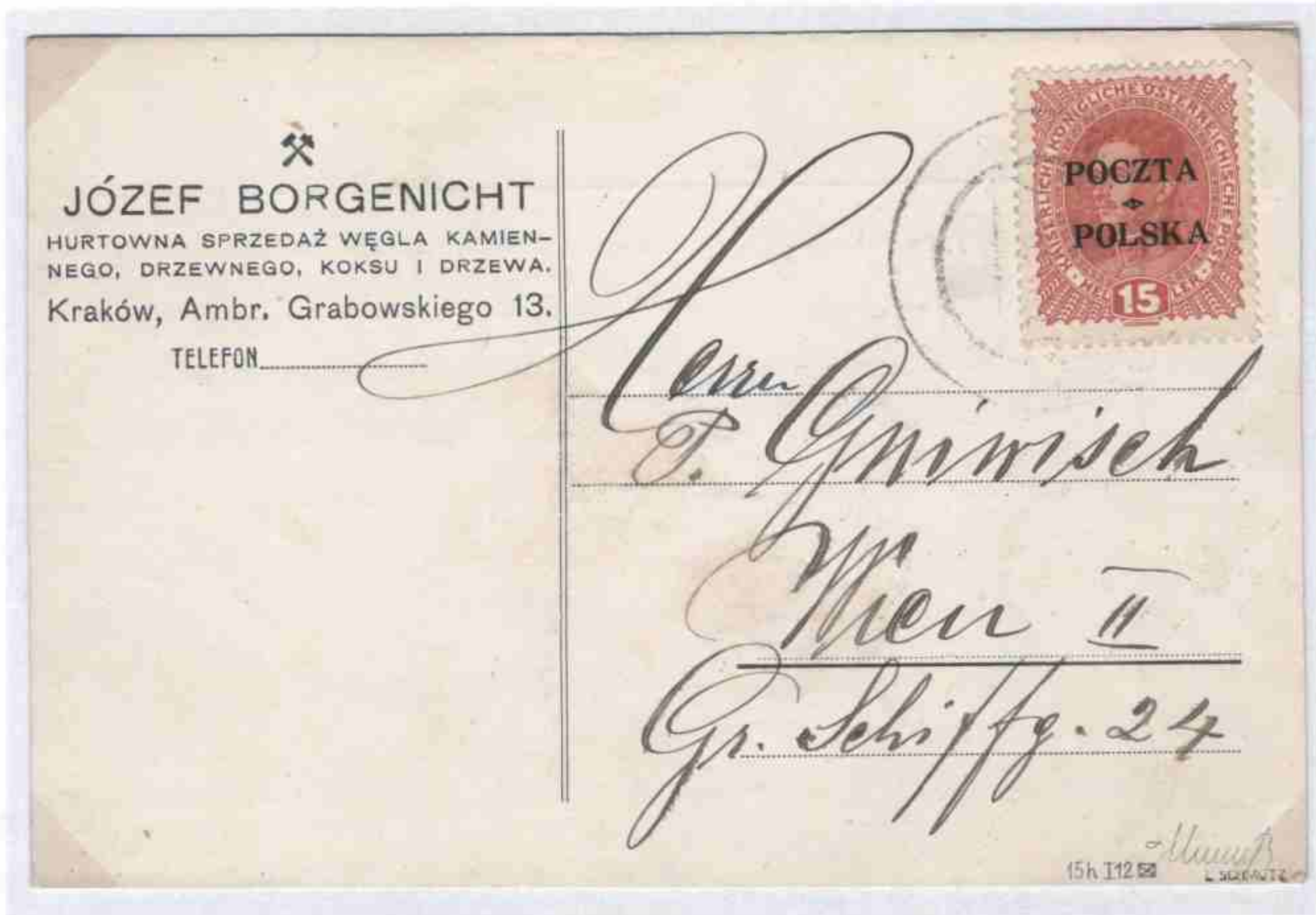
B2 - colon

company postcard sent on April 17, 1919 from Krakow to Vienna paid 15 hellers according to the national tariff applicable to the whole country