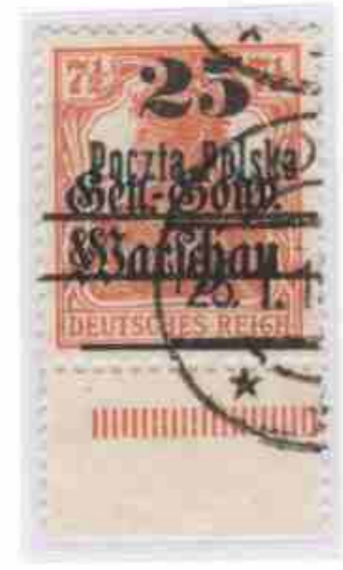
B4 - 3rd line missing