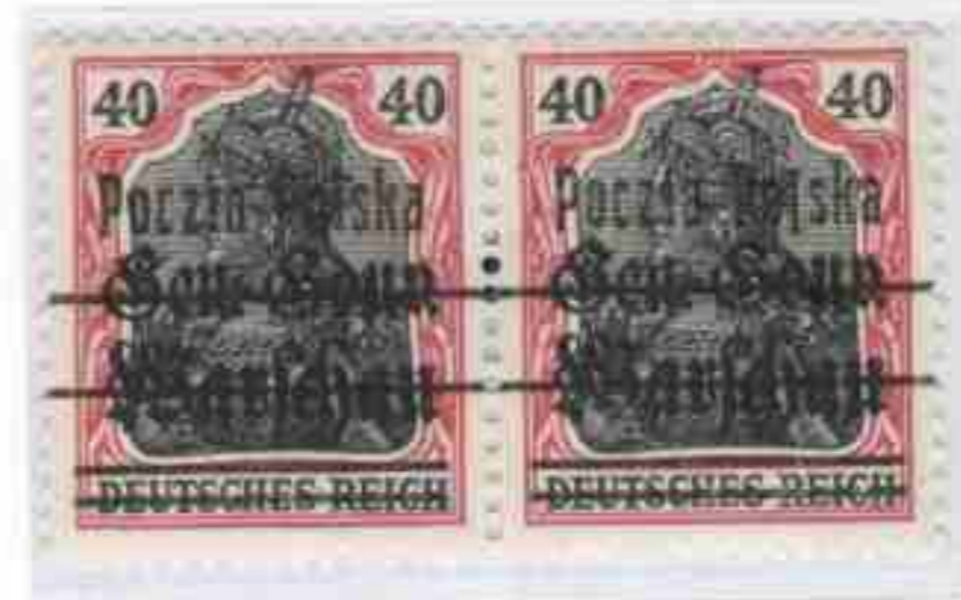
B3 - lowered I