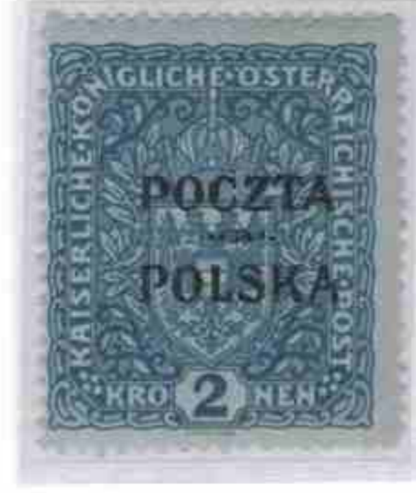
gray-blue gray paper very rough B8 – notch in S