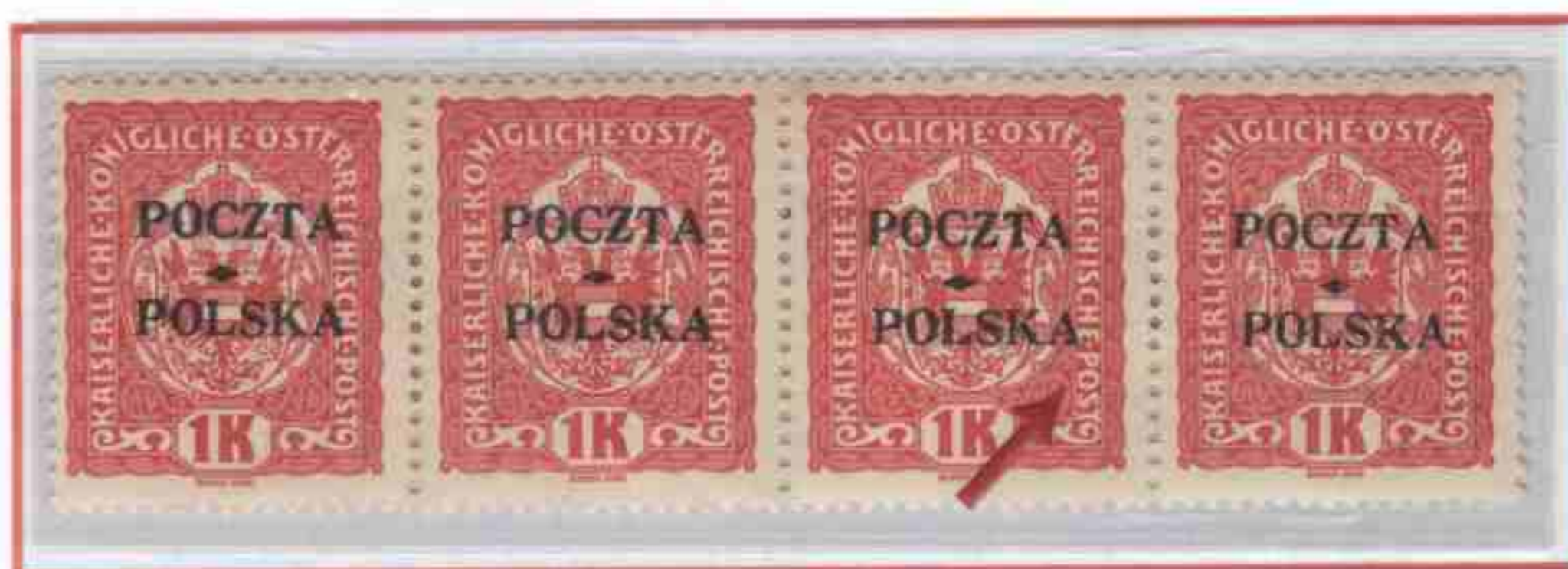
B12 – defects A w POLSKA on the 29th stamp - certificate C So far, only a few of these four stamps are known - RRR