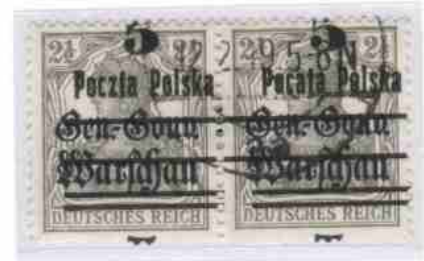
light gray GGW mat