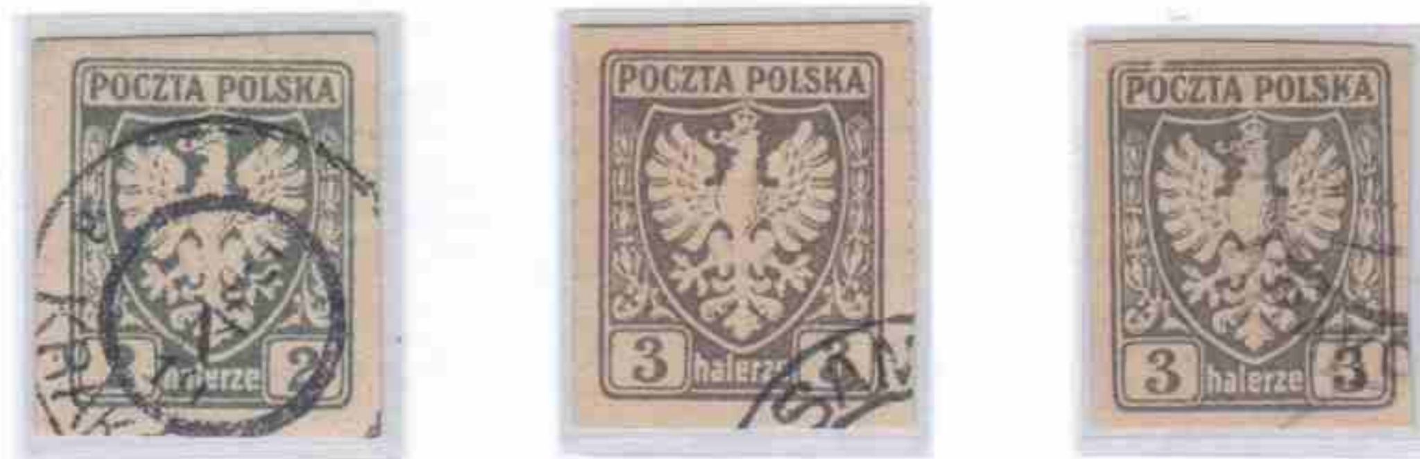
damaged upper frame

imperforate stamp, grey-yellowish wood paper, printing defects