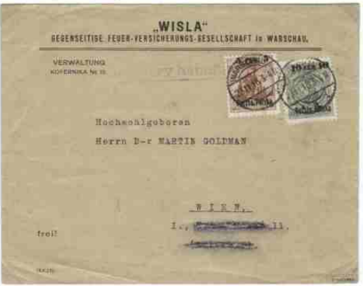
Stamps of the provisional 'Warsaw' issue on the envelope of a commercial letter sent on November 21, 1918 from Warsaw to Vienna.

Name of elaboration: Polish Postal Signs vol. 1 Warsaw 1966 Catalog of Polish postal signs, vol. 1 - Fischer 2018