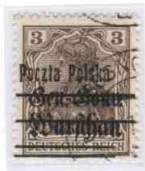
yellow-olive-brown GGW semi-glossy

subsequent rows in the sheet - distance of the second to third line 4.0 mm