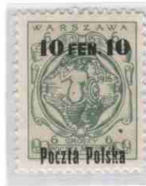
B3 – dot in k