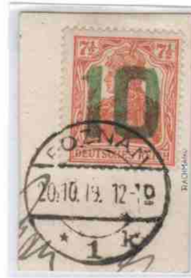
overprint light olive green