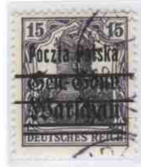
grey-violet GGW semi-glossy

subsequent rows in the sheet - distance of the second to third line 4.0 mm