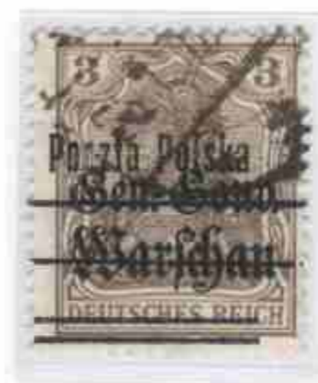
overprint aniline GGW semi-glossy