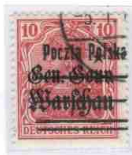
stamp from edge sheet