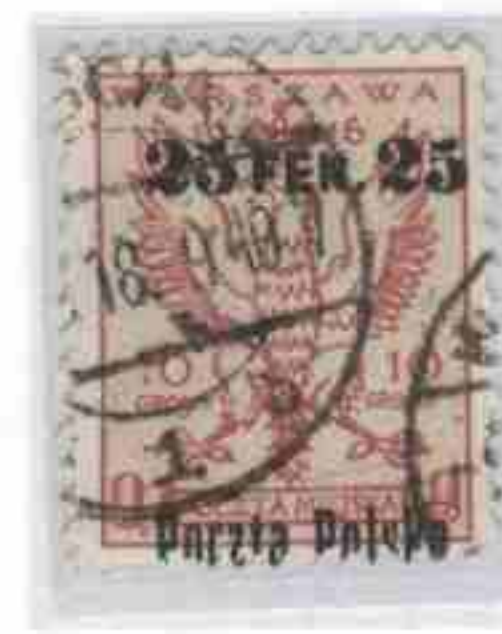
B2 – fault FEN