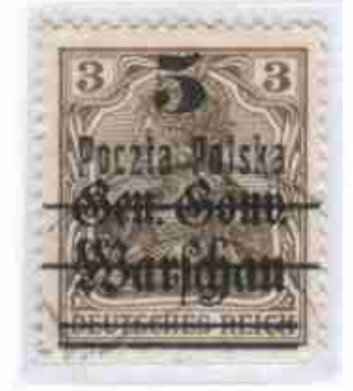
yellow-olive-brown GGW semi-glossy