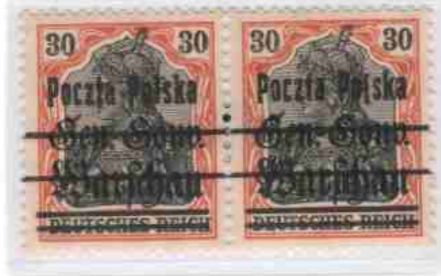
B3 - lowered I