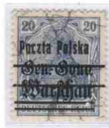
B2 - dot between o and c