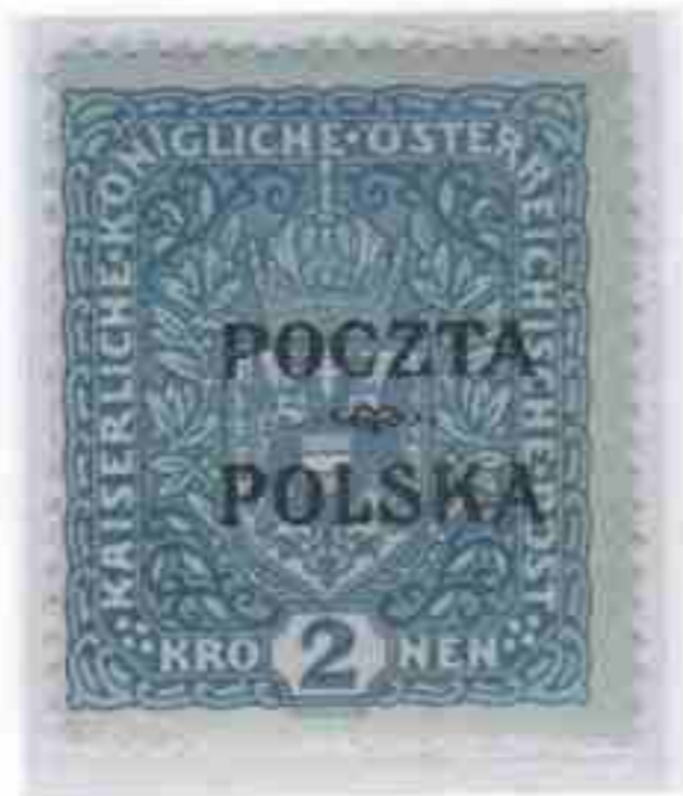
light gray-blue light gray smooth paper