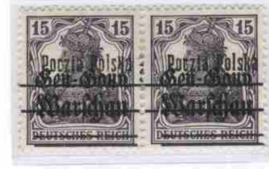
B7 - reversed k