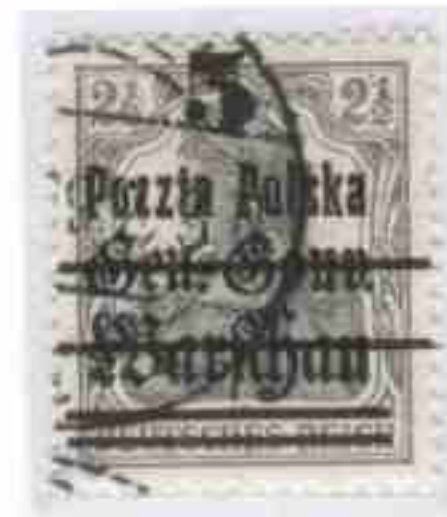
gray dark green GGW mat