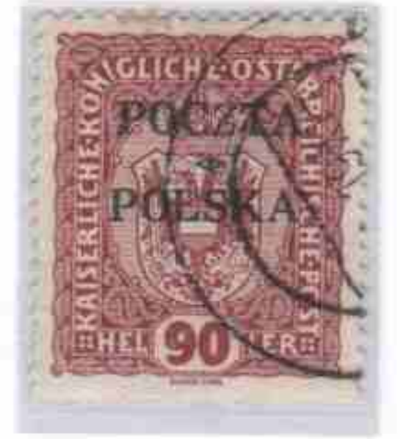
B1 – thin Z