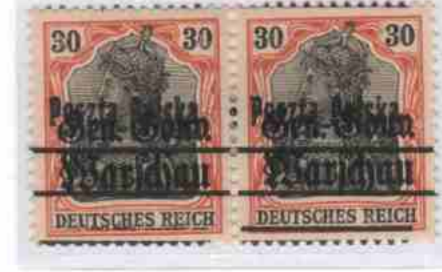
B4 - 3rd line missing