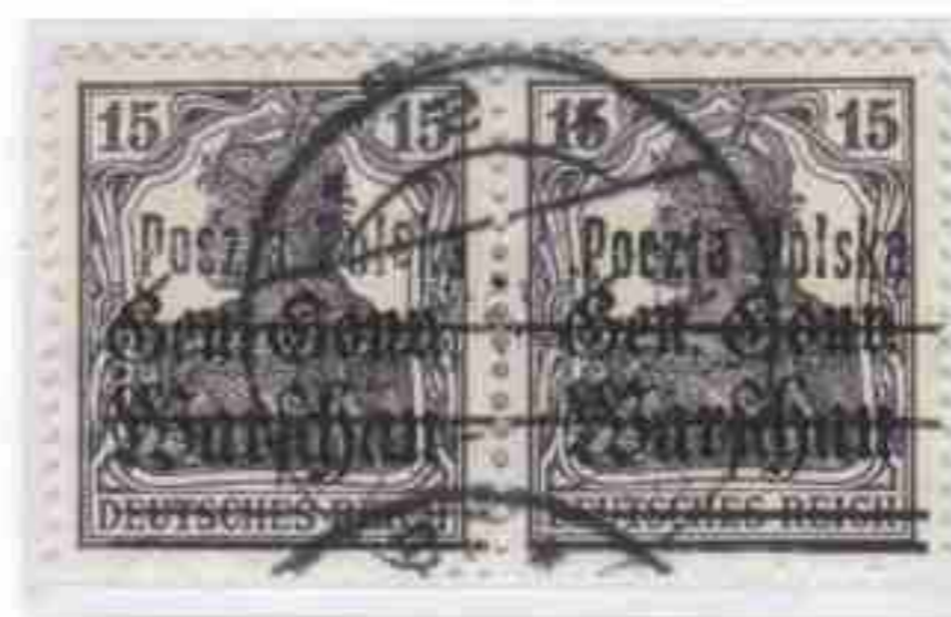
B6 - raised s