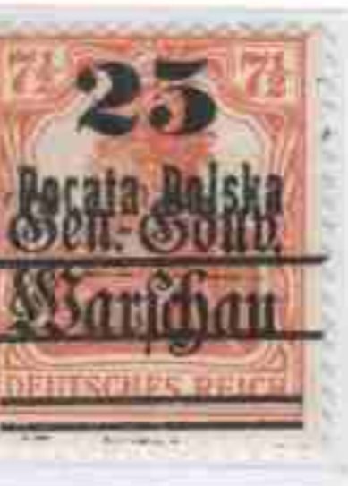
B1 - Pocata