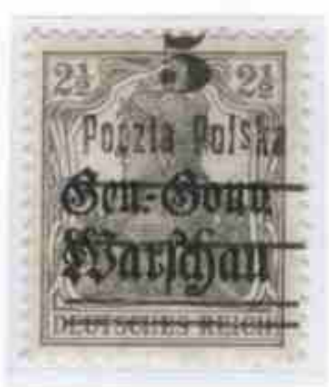
B6 - raised s