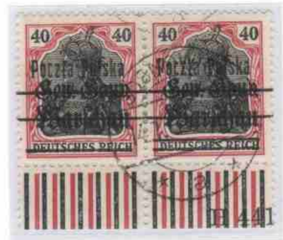
B4 - 3rd line missing