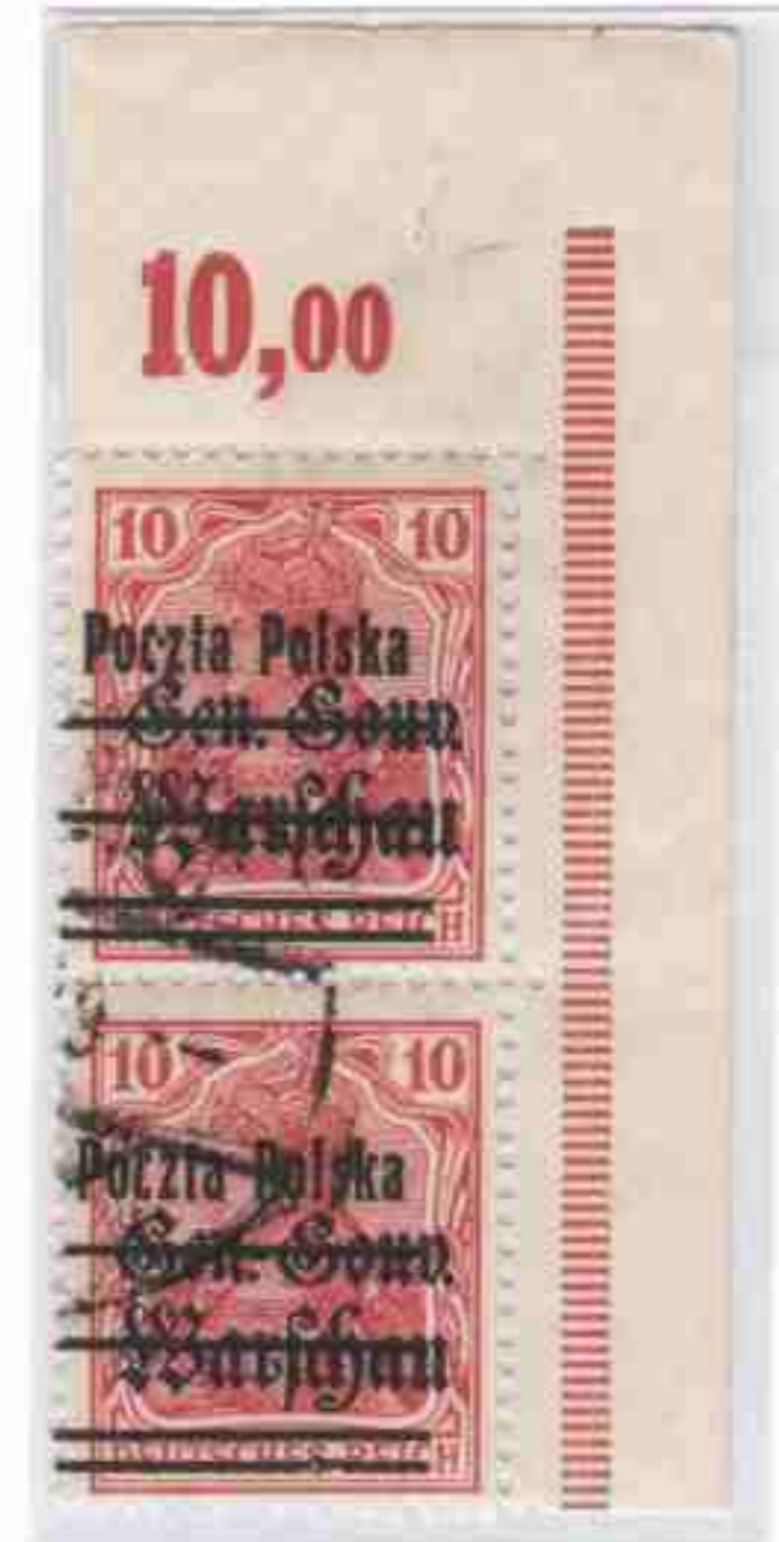
light red GGW mat