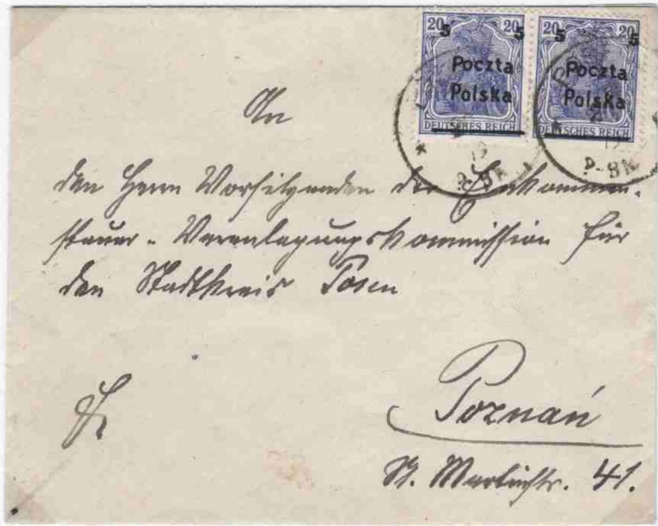
stamps on the envelope of a local letter in Poznan paid 10 pfennig according to tariff of August 20, 1919