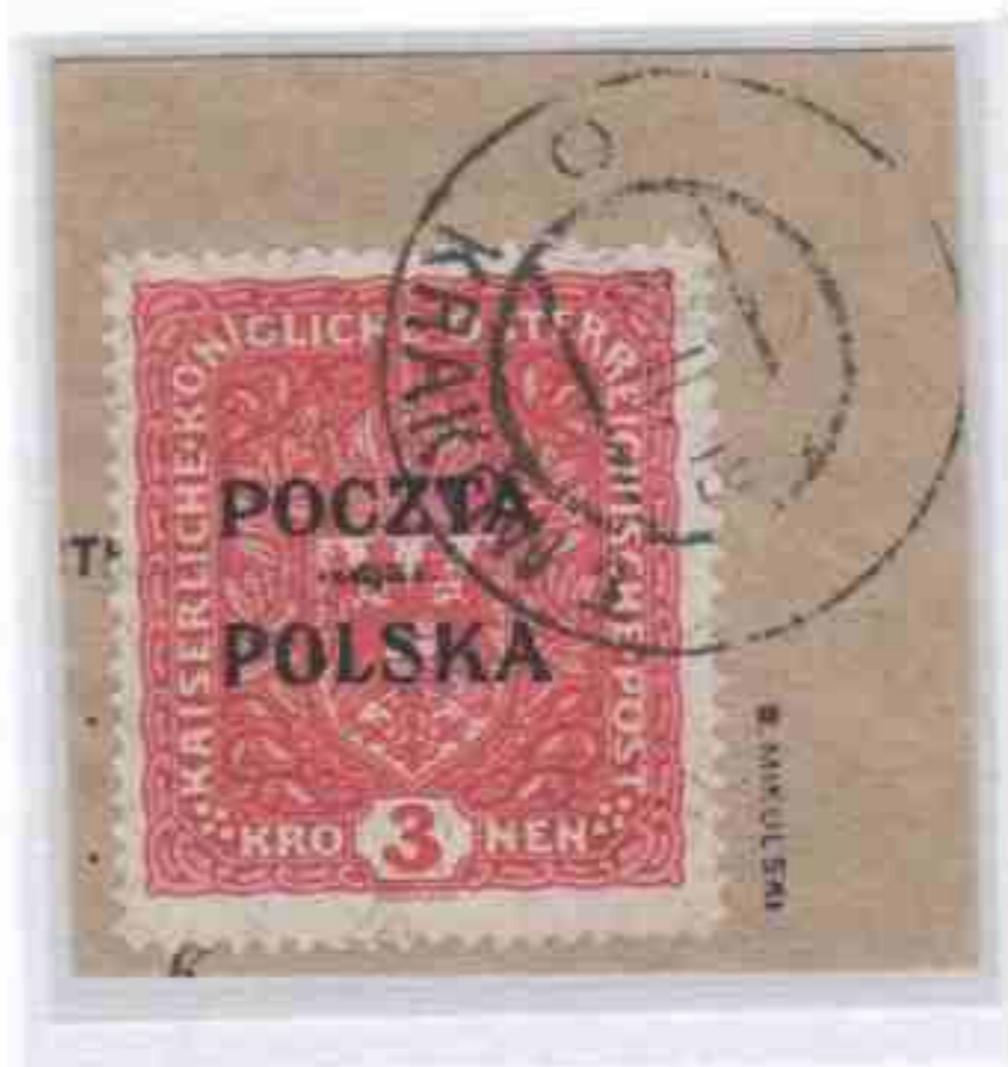
light pink red