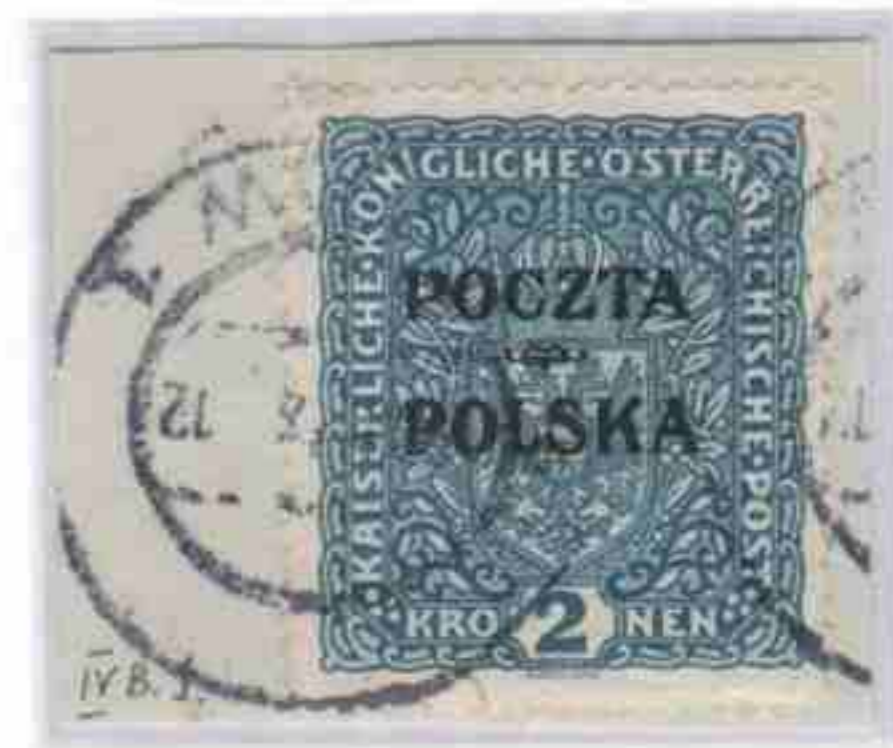
greyish blue white paper