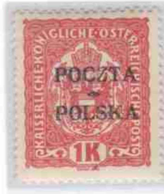
B1 – thin Z