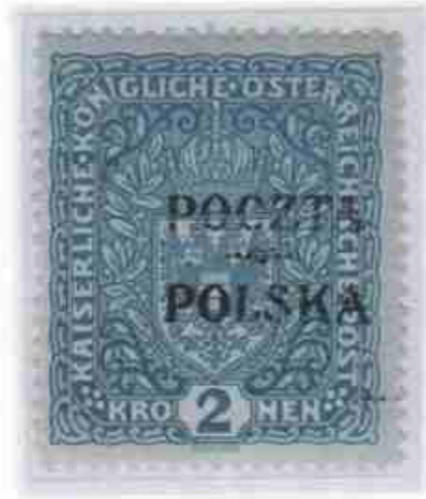
gray blue gray paper very rough B6 – thin S