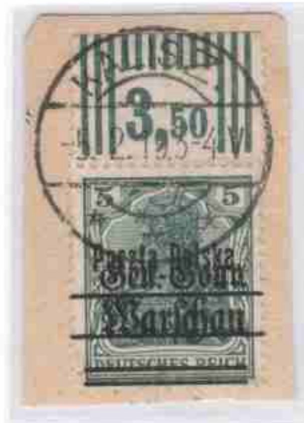
dark green GGW mat