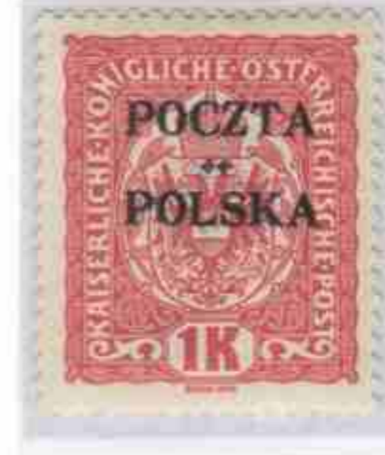
B2 – colon