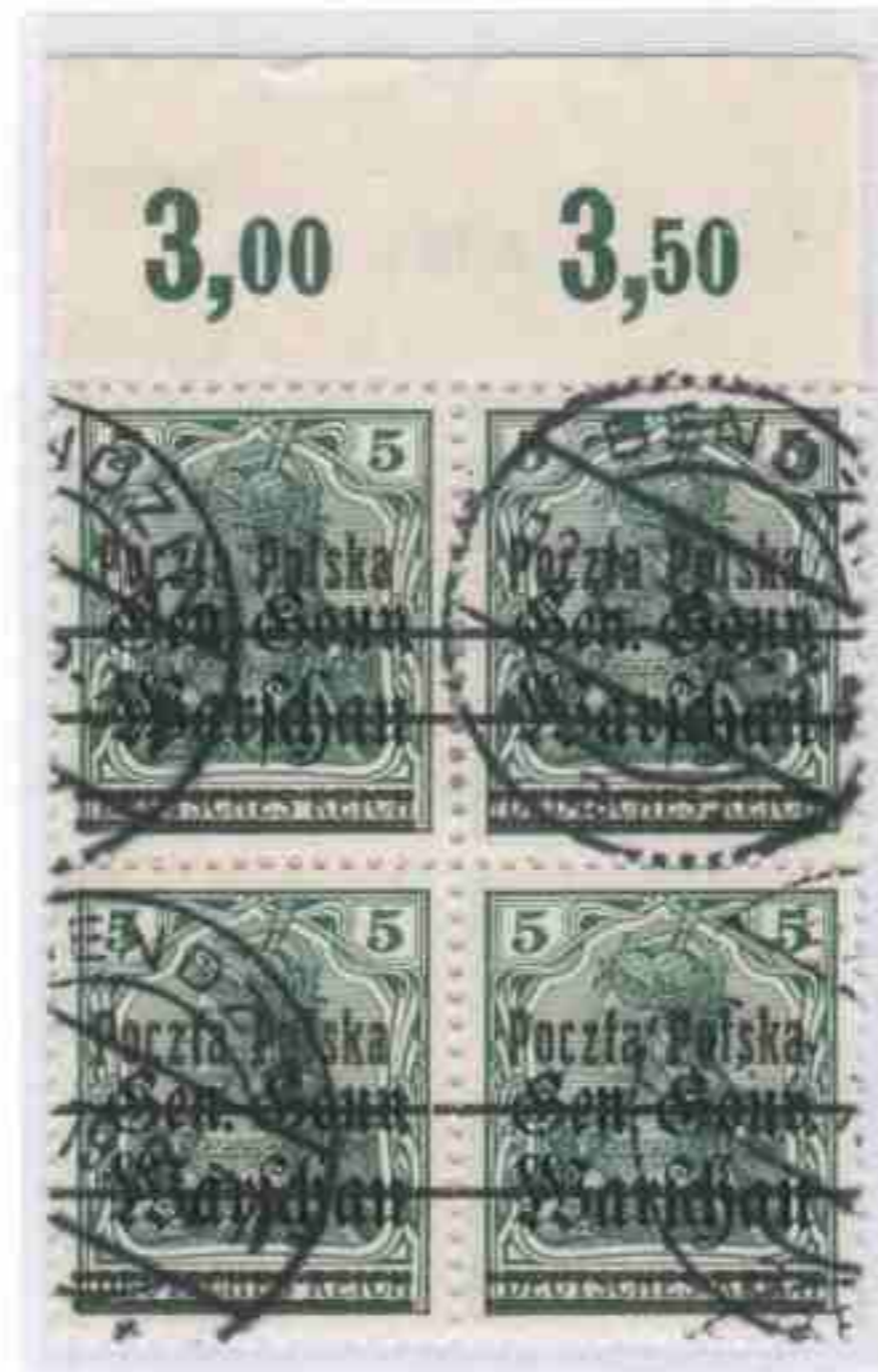
blue-green metallic GGW glossy