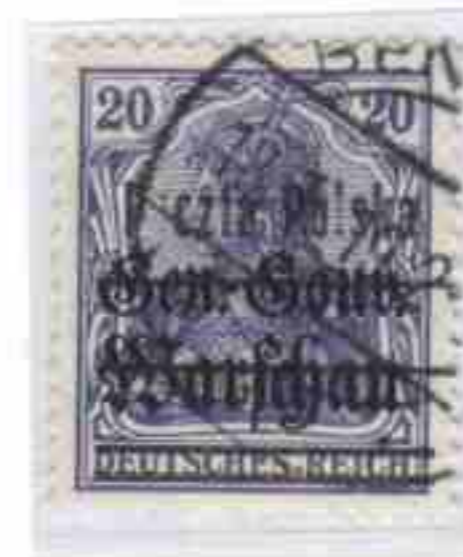
B12 - damaged o in Polska