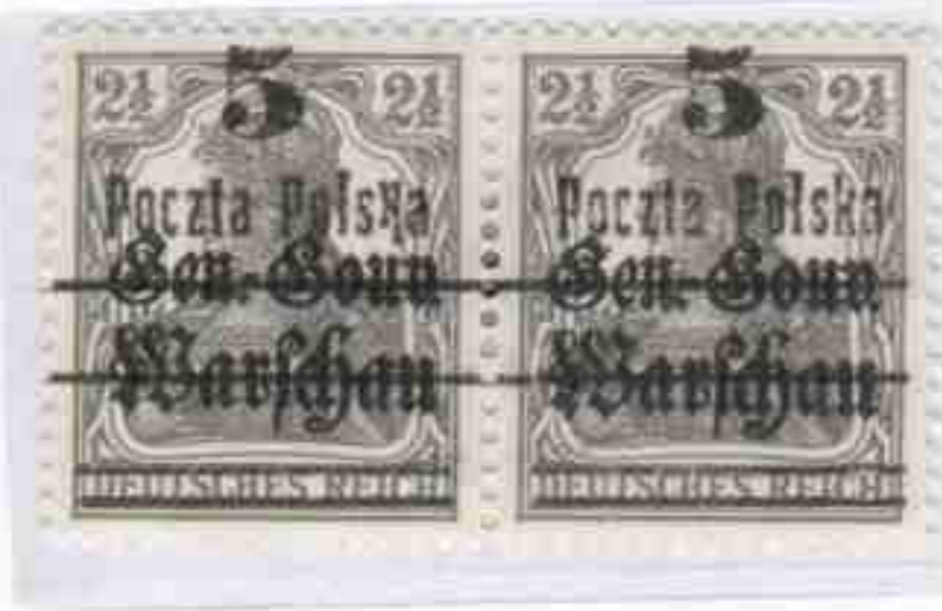
B7 - reversed k