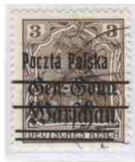
Light-olive-braun GGW mat