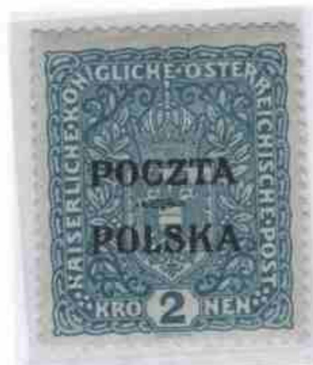
light gray-blue greyish, rough paper