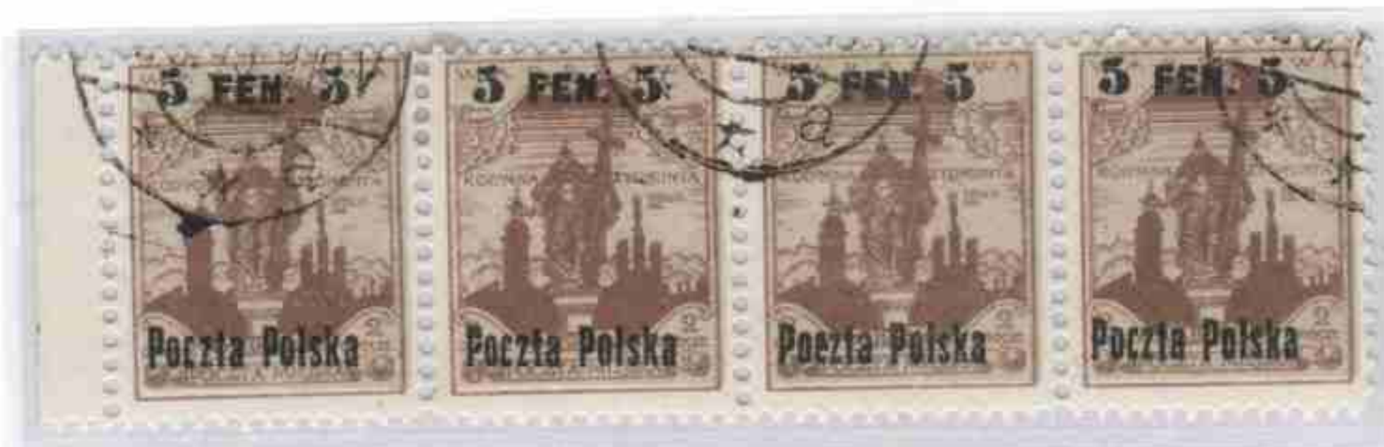
B5 – dot in 5

line perforation 11½ - color shades, shifts and printing defects