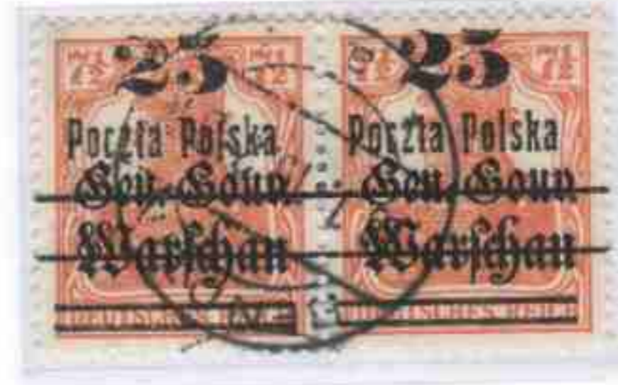
B3 - lowered I