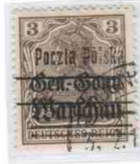
light olive-brown GGW mat