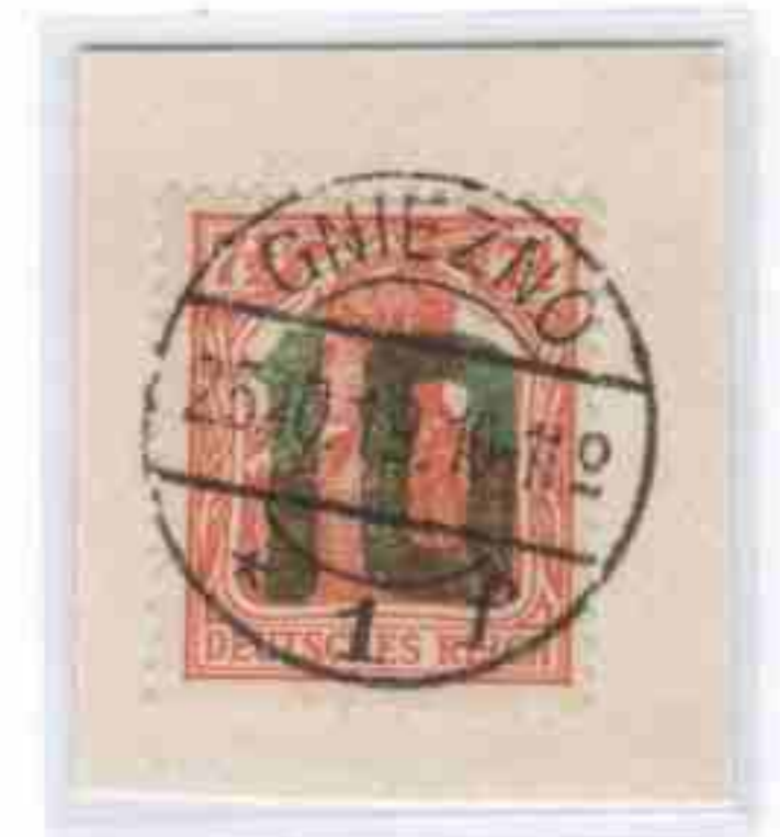
overprint olive green