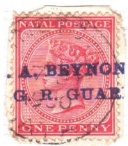
* A. Beynon with Pinetown postmark 7 JY 1900