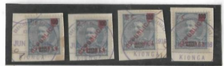
Kionga was a small triangular area of German East Africa taken by the Portuguese in April 1916 after Portugal declared war on Germany in March 1916.

Trade, mostly slavery, on the East coast of Africa was controlled by the Arabs until the Portuguese started to take over from the end of the sixteenth century. The centre of their control was the island of Mozambique, named after an Arab trader, Mussa Bin Bique. For four centuries the Portuguese control was very tenuous of what became known as Portuguese East Africa. This led to the Portuguese setting up three companies in the early twentieth century to develop the interior: The Nyassa Company, the Zambezia Company and the Mozambique Company. Mozambique, Inhambane and Lourenco Marques were directly controlled provinces. Initially, from 1877, the stamps of the province of Mozambique were used throughout Portuguese East Africa, but from about 1892 the stamps of the individual provinces were used. By 1942, when the Mozambique Company charter ended, all areas were using stamps inscribed Mozambique which had become the name of the whole country.