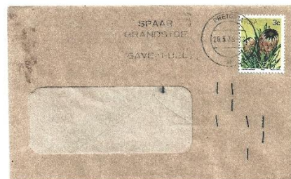
A standard non-sealed (commercial) envelope