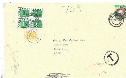
A non-standard cover with a 5 cent stamp. The postage rate was 10c. The cover was taxed 2 x 5c: 10c. Postage due stamps to the value of 10c upper left corner of cover.